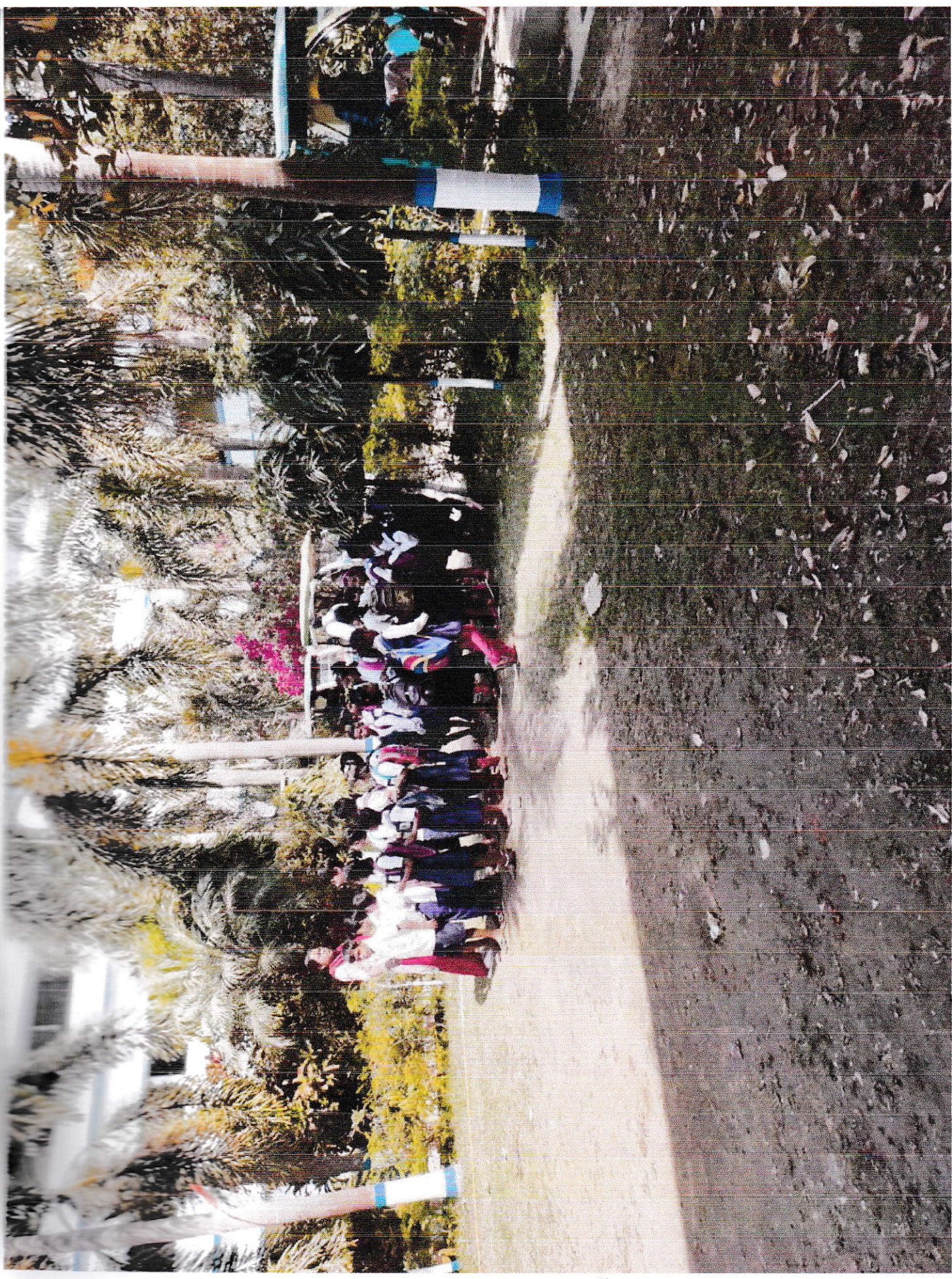
Visit to the College garden